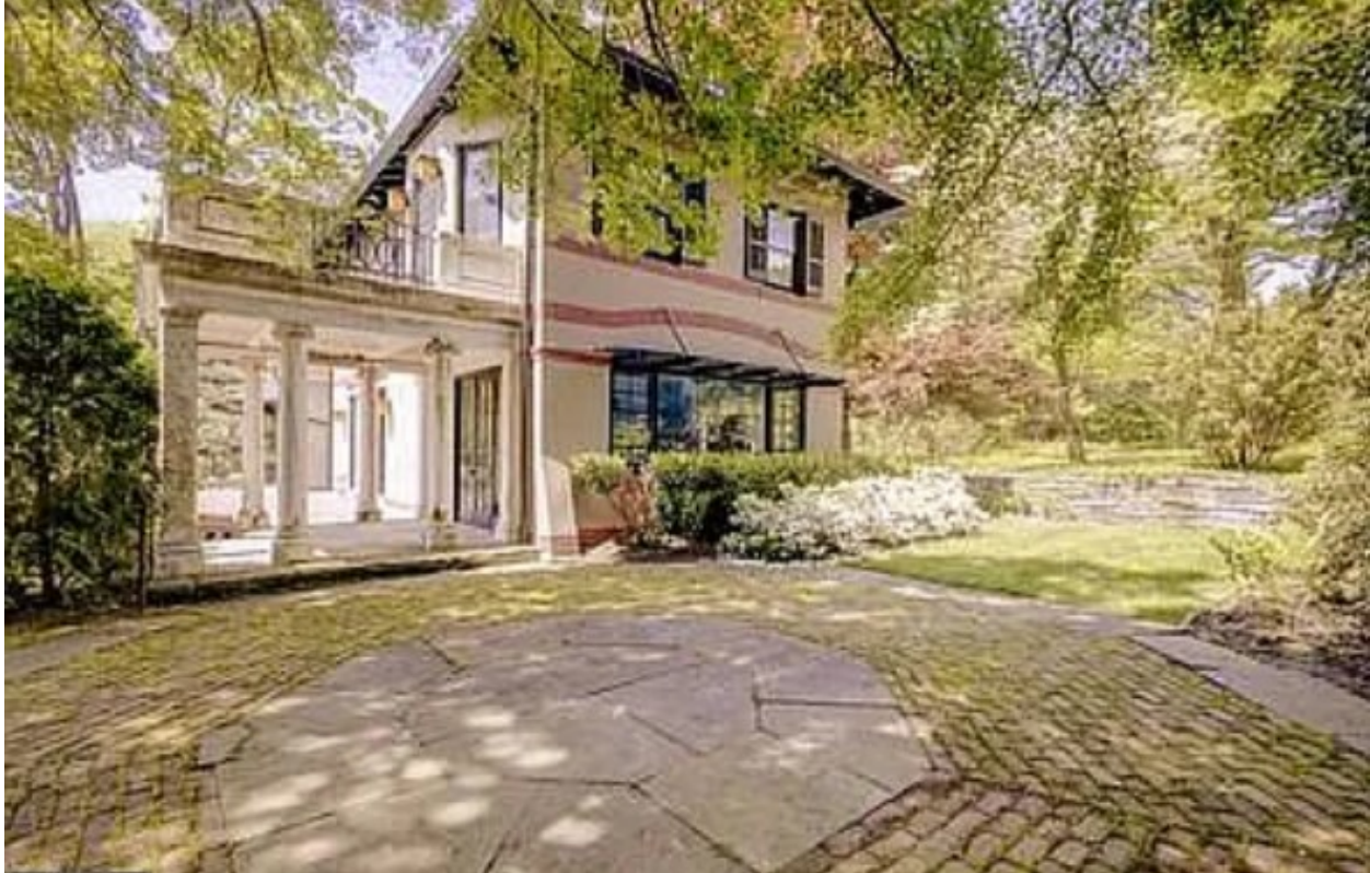
Figure 9. Southeast façade with alternate view of Peck patio.

The southeast, stucco-clad façade of the building includes a shed dormer within the hipped roof, two three-by-three muntin over one windows with wood shutters on the second floor, two brick beltcourses (one straight and one arched) and the side of the second floor terrace with low stone walls and a central ornamental metal fence, and, on the first floor, a tripartite window with a large single light window at center with two-by-six muntin windows on either side, a brick sill, and a flat, latticed overhang at top. This façade also includes the side of the first floor stone terrace with stone columns.