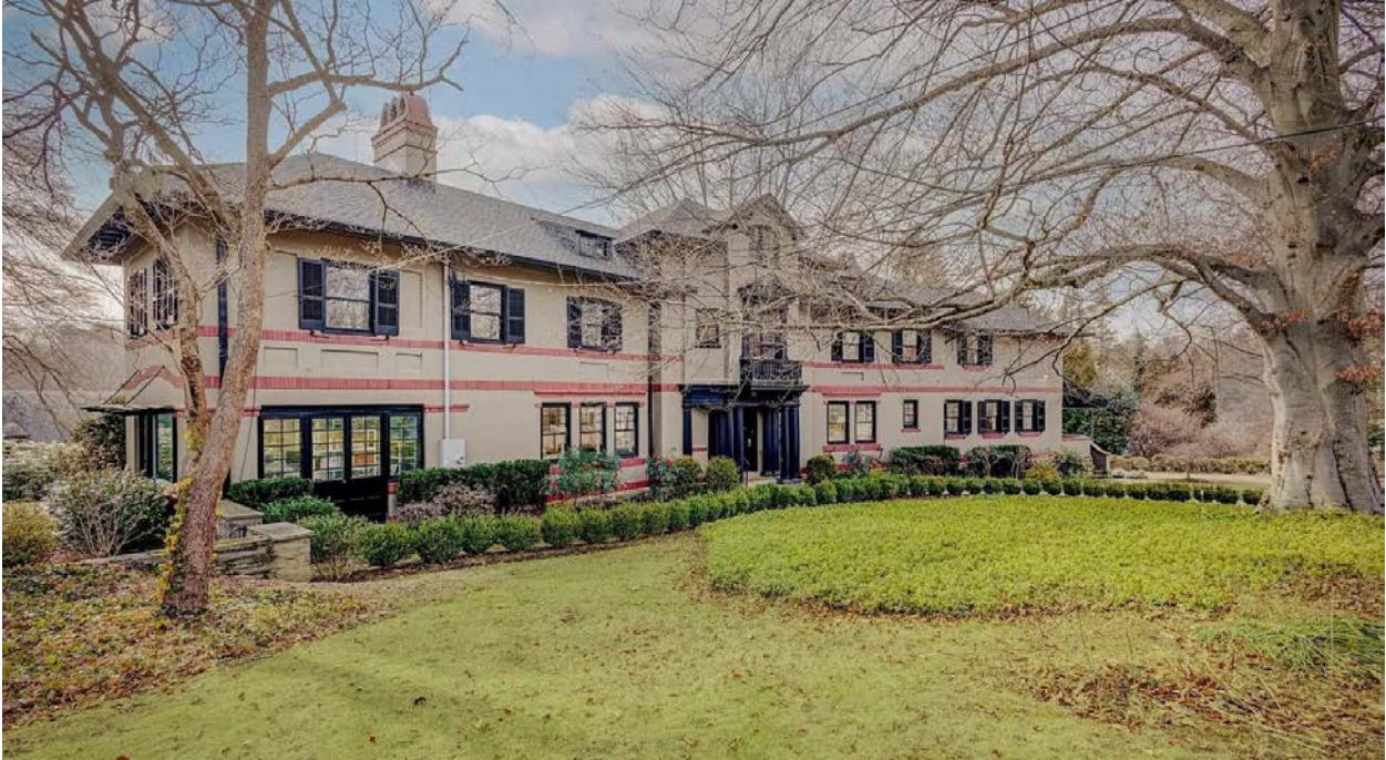
Figure 4. Northeast façade (facing Navajo Street).