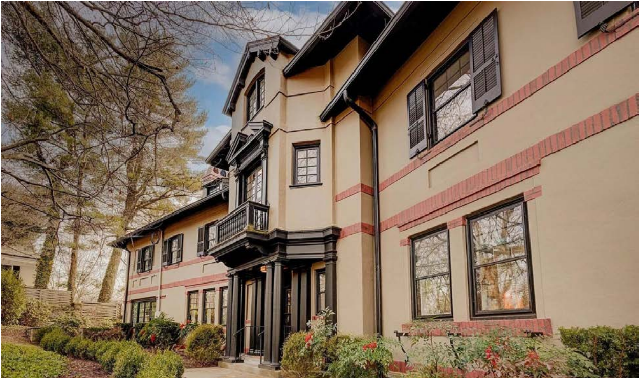
Figure 5. Northeast façade detail.

The northeast, stucco-clad façade of the building, facing Navajo Street, includes two two-story volumes connected by the central, three-story entrance volume.