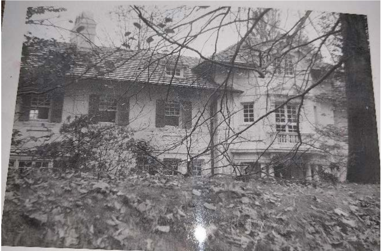
Figure 14. The front [north] façade of the house at 7716 Navajo Street as it appeared in 1947.