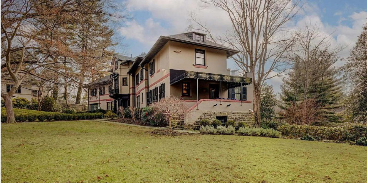
Figure 10. Northwest façade.

The northwest, stucco-clad façade of the building includes a shed dormer with the hipped roof, a single three-by-three muntin over one window with brick sill, and a projecting porch with brick trim and stairs leading to a stone-clad portion of the façade with a single window at basement level. The porch includes a canvas overhang with two three-by-three muntin over one windows, and the side of the projecting rear volume described above.