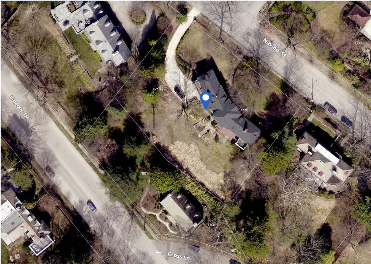
Figure 2. Aerial view of 7716 Navajo Street.