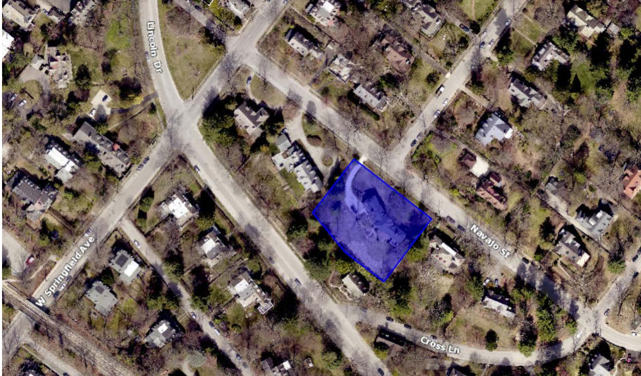
Figure 1. The subject property at 7716 Navajo Street, shown in blue.

Address: 7716 Navajo Street Philadelphia, PA 19118 OPA# 092287410