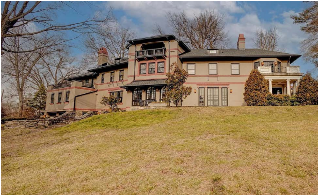
Figure 6. Southwest façade (facing toward Lincoln Drive).

The northwest volume of this façade includes a hipped roof with widely overhanging eaves and three bays, with three one-over-one windows with brick sills and wood shutters on the second floor, brick beltcourses between the floors, and, on the first floor, two three-by-three muntin over single light windows with brick sills, a smaller two-by-two muntin over single light window with a brick sill, and three three-by-three muntin over single light windows with wood shutters and brick sills. This volume also includes a brick beltcourse at grade, and a prominent chimney topped by three brick arches.