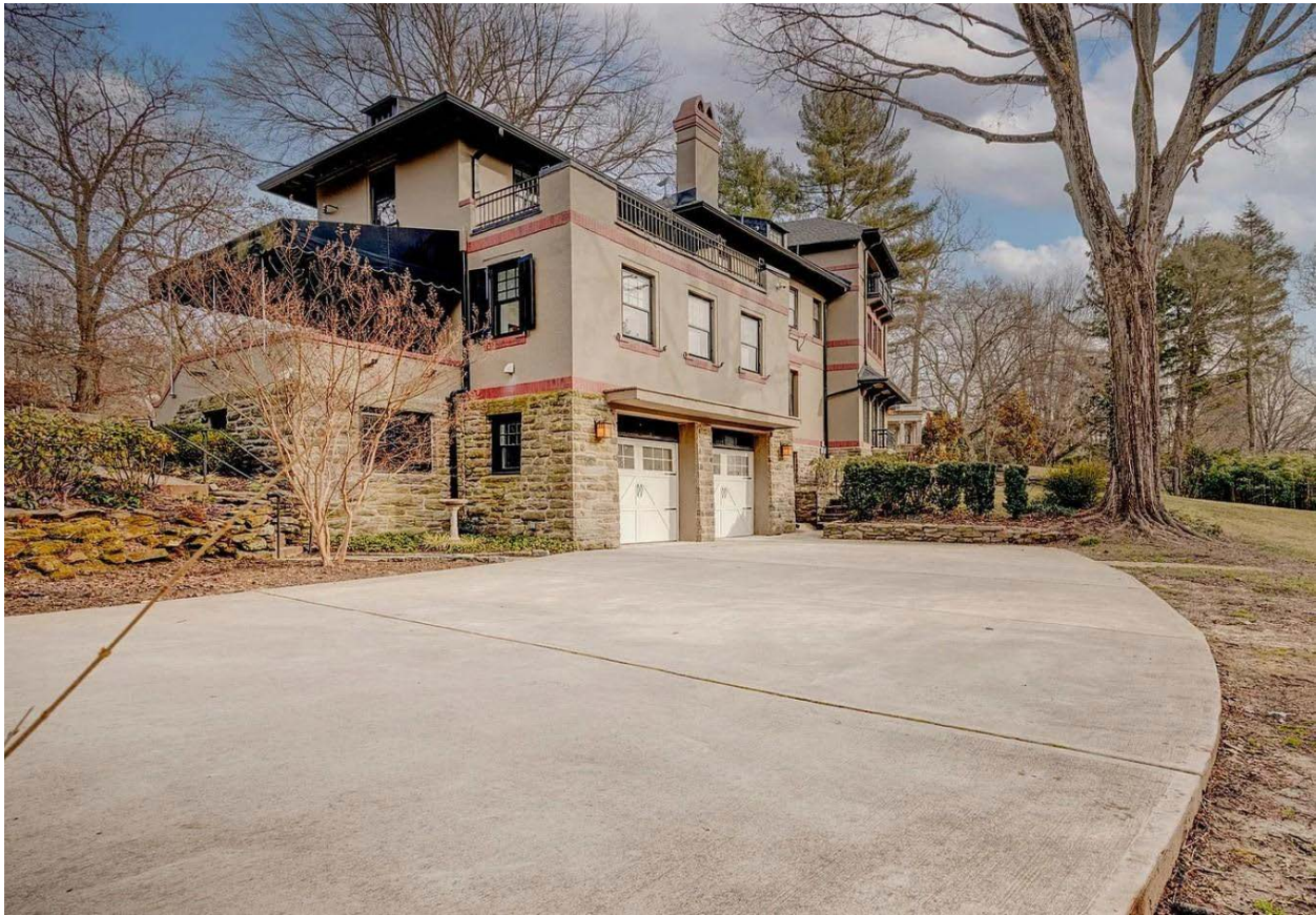
Figure 7. Northwest façade with partial view of southwest façade.

The southwest, stucco-clad façade of the building, facing toward Lincoln Drive, includes two two-story volumes connected by the central, three-story entrance volume.