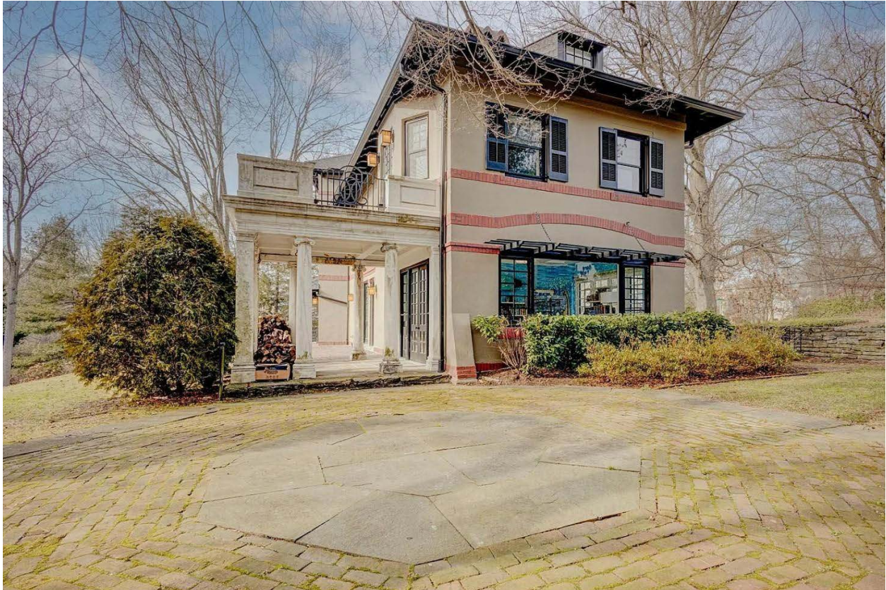
Figure 8. Southeast façade. The patio designed by Frederick Peck is in the foreground.

This rear façade also includes a brick beltcourse at grade, and features Arts and Crafts style external lamps, although it is not clear if these are original to the building.