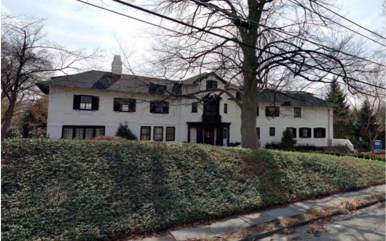
Figure 13. The house at 7716 Navajo Street as it appeared in 2018.