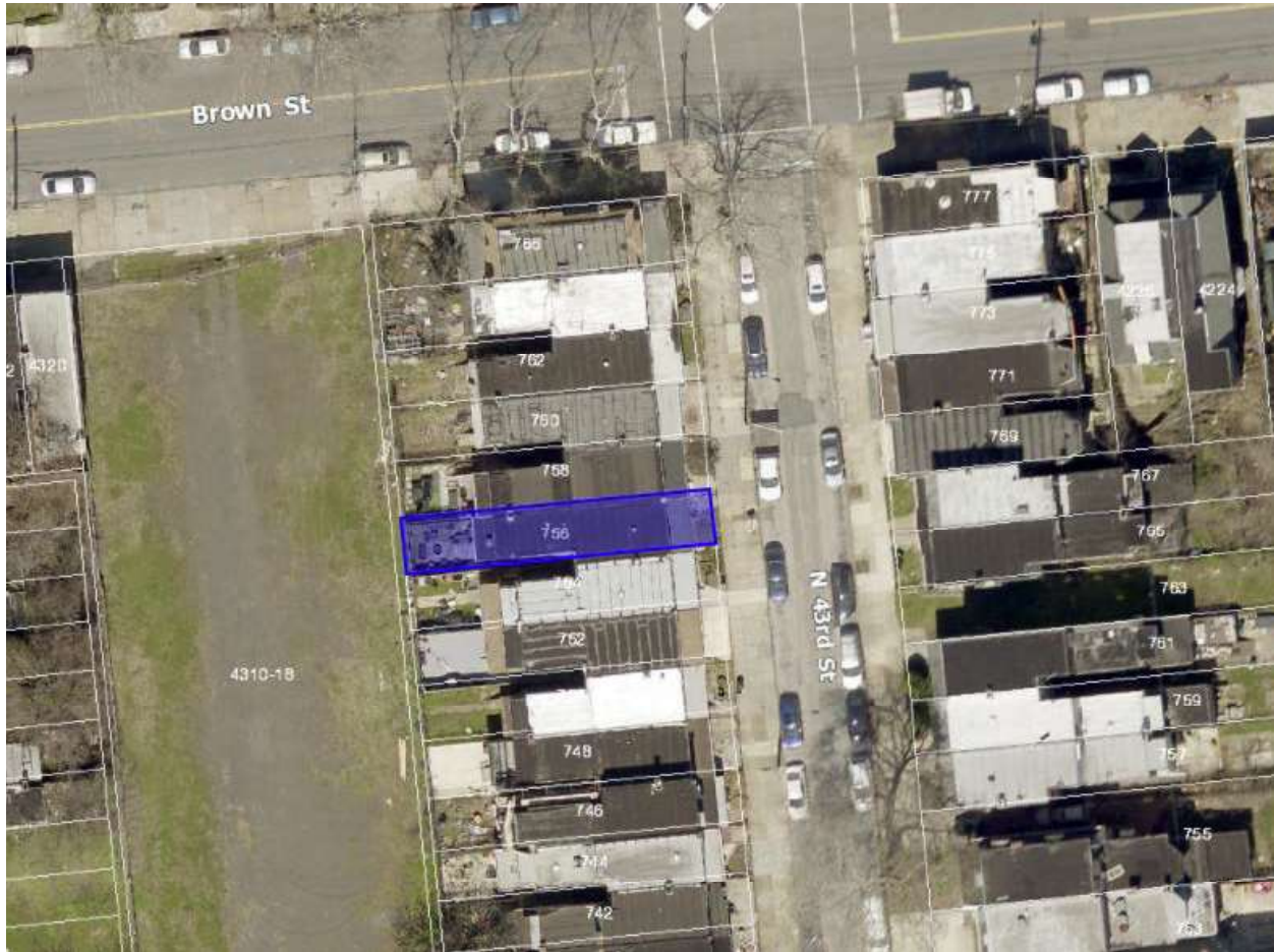
Figure 1. The boundary identifying the parcel at 756 N. 43rd Street.

All that certain lot or piece of ground with the brick message or tenement thereon erected. Situate on the West side of 43rd Street at the distance of 84 feet 4.5 inches Southward from the South side of Brown Street in the 60 th (formerly part of the 24 th ) Ward of the city of Philadelphia, County of Philadelphia and the commonwealth of Pennsylvania. Containing in front or breadth on the said 43rd Street 16 feet 1.5 inches and extending in length or depth Westward of that width between lines at right angles with the said 43rd Street 90 feet to a certain three feet wide alley extending Northward into the said Brown Street. 1