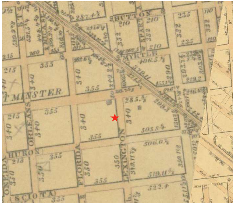
Figure 3: Map showing location of 756 N. 43 rd Street before the house had been built. Much of the surrounding area is undeveloped, but there is a single building at the corner of 43 rd Street and what would become Brown St. Smedley's Atlas of Philadelphia 1862 . North at top of image.