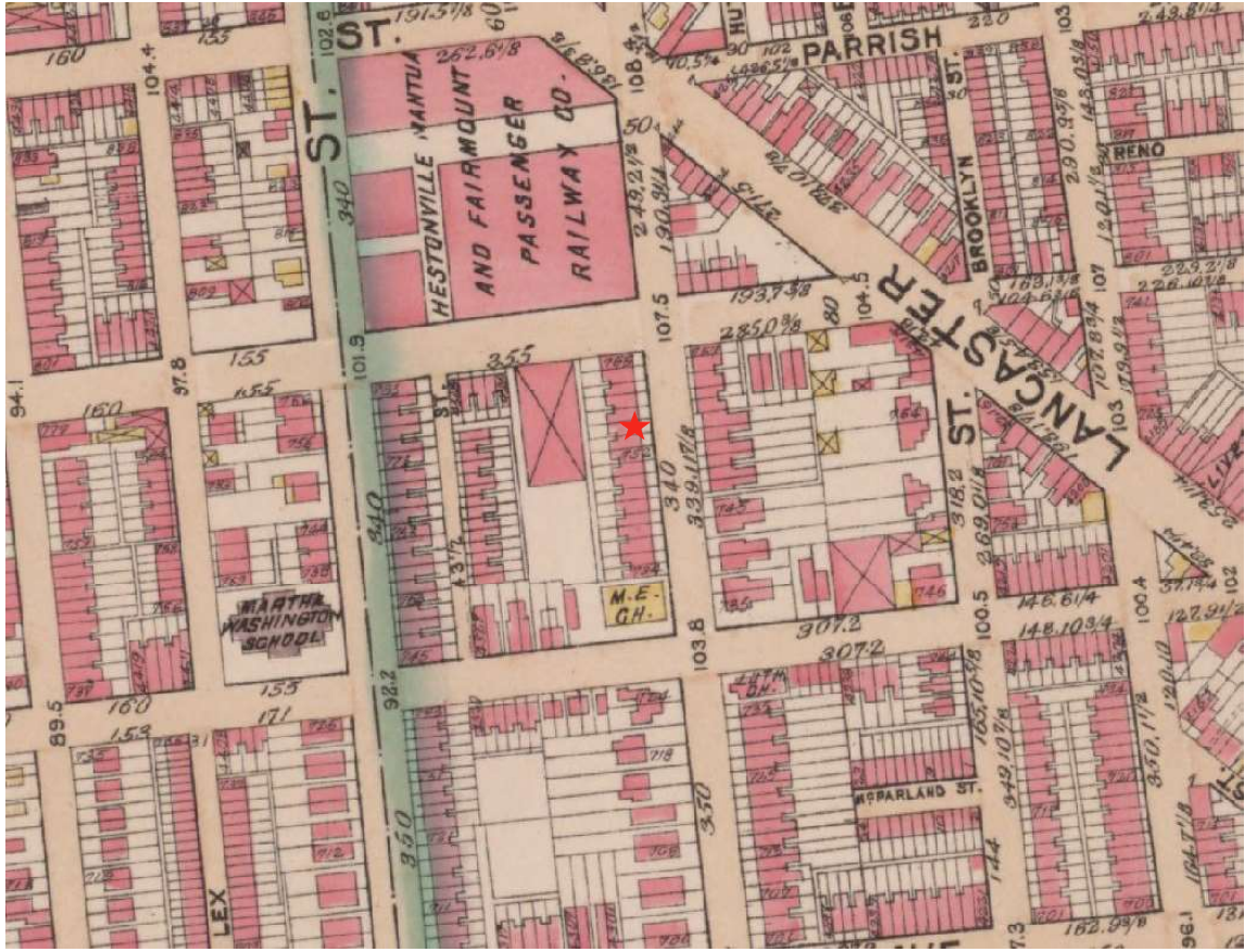
Figure 5: Detail of an 1895 atlas showing property after the row was built. Bromley, G. W., Atlas of the City of Philadelphia . North at top of image.