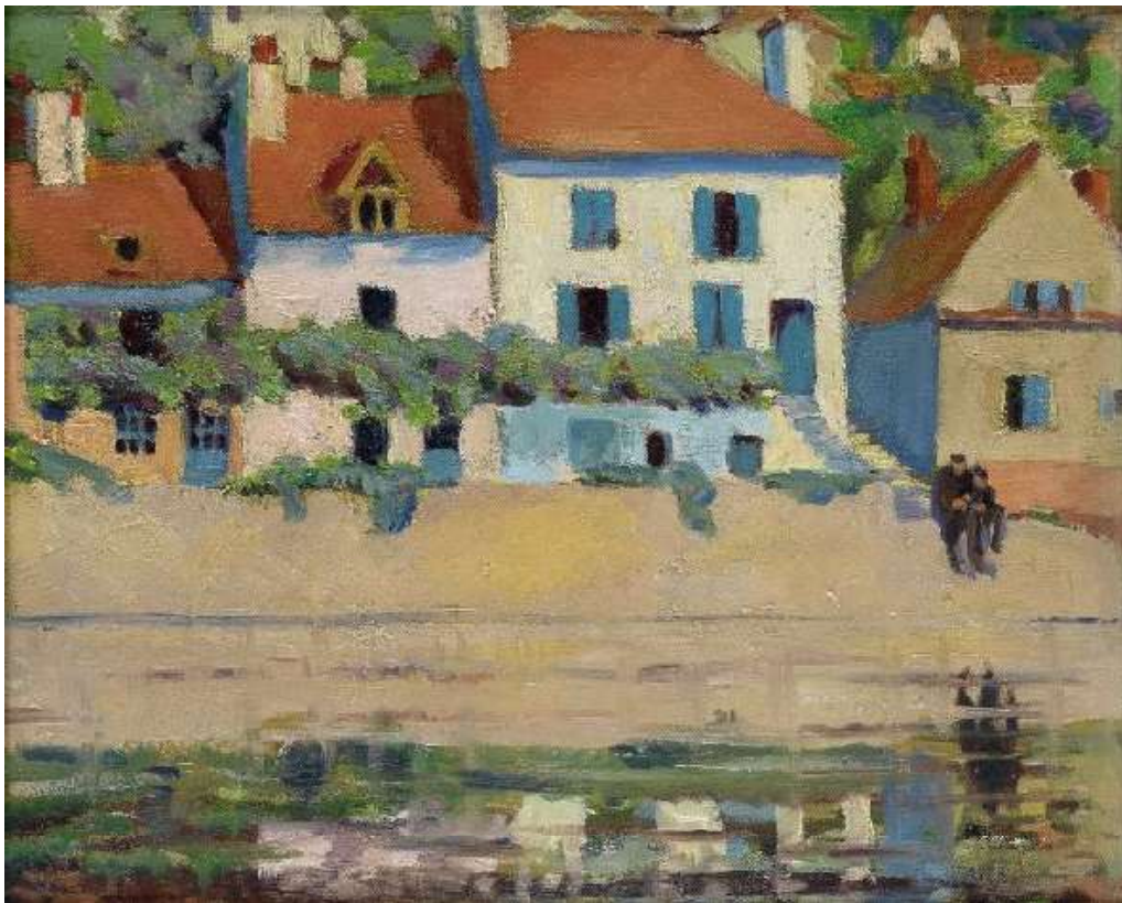
Figure 7. The Houses at Semur , 1925.

Upon her return from Paris, she continued her work at Cheyney where she founded and taught in the new art and music departments, which she would go on to chair for 30 more years. While teaching, she also pursued her own painting career and continued to travel to Europe to further her studies. Waring's second trip to France in 1924 is regarded as a turning point in her style and career. While there she expanded her work in portraiture and studied painting in the Academie de la Grande Chaumiere and her work was also exhibited in Parisian art galleries for the first time. Although she learned the techniques of Romanticism and Impressionism during this trip, her own work tended towards Realism. The Houses at Semur, France (Figure 7) which she painted while abroad in 1925, gained acclaim on both sides of the Atlantic and has been noted by art historians as the work that marked Waring's change in style. The painting's vivid color, light and atmosphere established hallmarks of her repertoire.