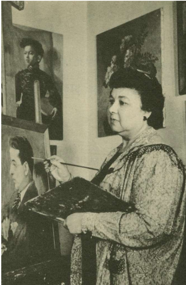
Figure 6: Laura Wheeler Waring.