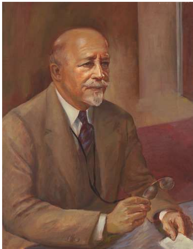
Figures 9 and 10. Marian Anderson , left, 1944 and W. E. B. Du Bois , right, 1944, both National Portrait Gallery.