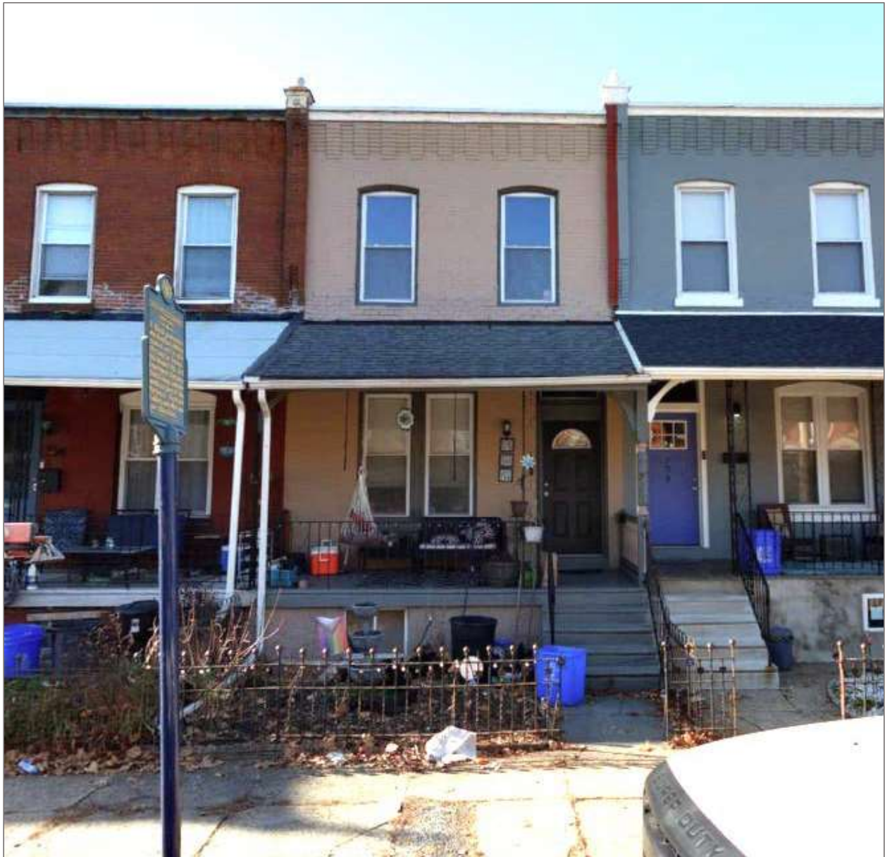
Figure 2. Front façade of 756 N. 43 rd Street.

The property at 756 N. 43 rd Street is a two-story Queen Anne-style brick rowhouse located in the Belmont neighborhood of West Philadelphia between Brown Street to the north and Aspen Street to the south. The building shares party walls with similar two-story brick row houses on either side.