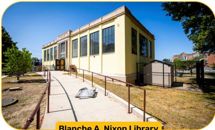
Blanche A. Nixon Library