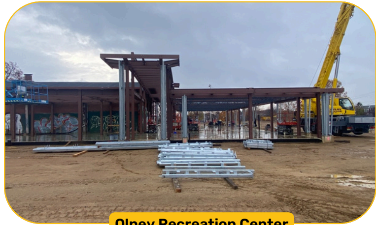
Olney Recreation Center