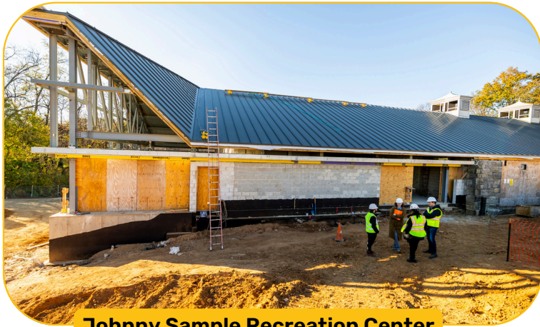
Johnny Sample Recreation Center

10 Rebuild sites in neighborhoods throughout the city are currently under or preparing for construction. The photos below show a selection of these transformative projects.