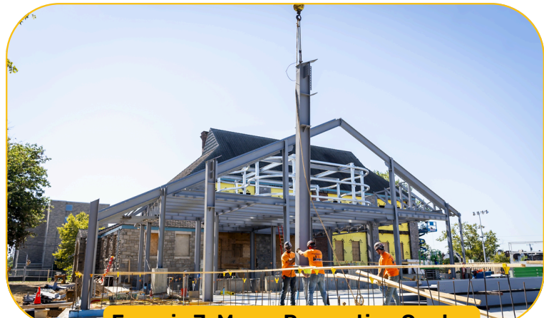
Francis J. Myers Recreation Center