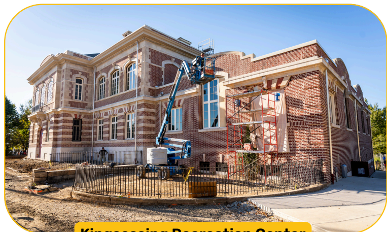
Kingsessing Recreation Center