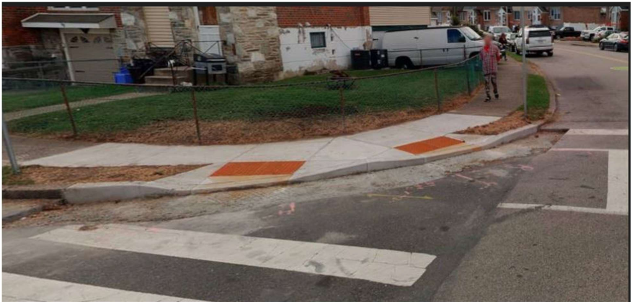
Before and After of Compliant ADA Curb Ramp at Drumore Drive and Modena Drive