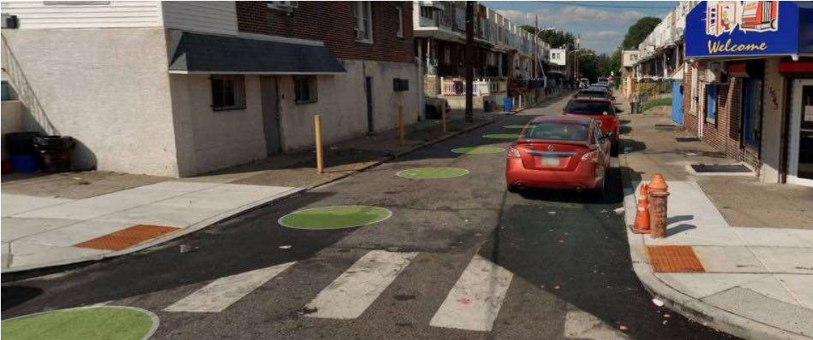
Before and After of Compliant ADA Curb at Luzerne St and Ormond Street