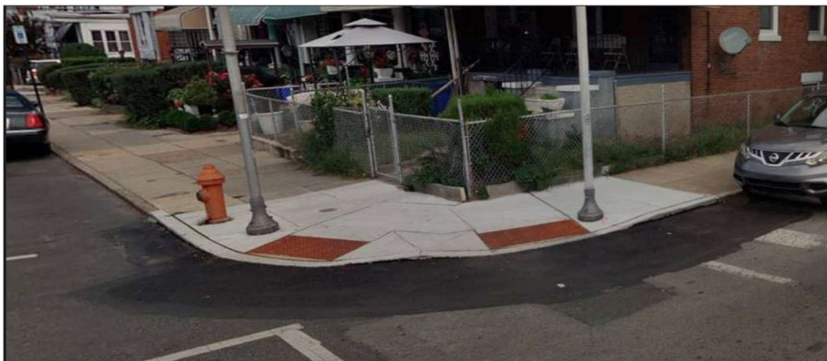
Before and After of Compliant ADA Curb Ramp at 57 th Street and Larchwood Avenue