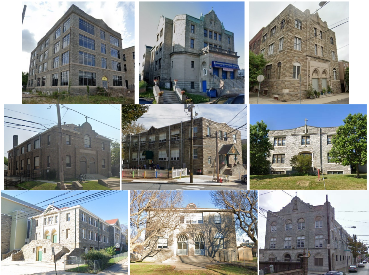
Figure 8: Left to Right, 1 st Row: Most Blessed Sacrament School Annex, 5600 Chester Avenue, Philadelphia, PA, 1925. Holy Name School, 700 Gaul Street, Philadelphia, PA, 1927. Saint Benedict School, 1919 Medary Avenue, Philadelphia, PA, 1925. 2 nd Row: Our Lady of Peace School Millmont Avenue, Ridley, PA, 1928. Saint Francis of Assisi School, 112 Saxer Avenue, Springfield, PA, 1929. Saint Thomas of Villanova School, 1225 E Lancaster Avenue, Bryn Mawr, PA, 1925. 3 rd Row: Saint Alice School, 150 Hampden Road, Upper Darby, PA, 1924. Demolished. Saint Charles Borromeo School, 1731 Hulmeville Road, Bensalem, PA, 1926. Saint Anne School, 2301 E Tucker Street, Philadelphia, PA, 1926.