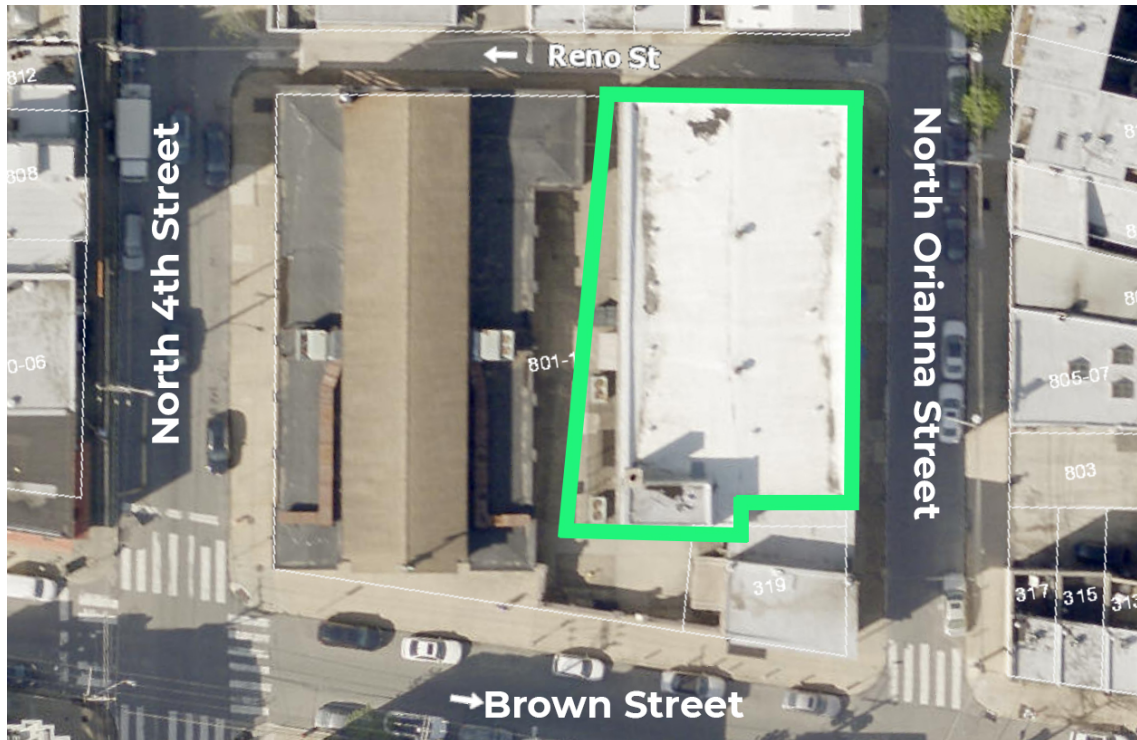
Figure 1: Aerial Photo: Philadelphia Atlas

THENCE, extending SOUTH 78 DEGREES 33 MINUTES 33 SECONDS EAST, along the said southerly side of Reno Street, a distance of 60 feet to point of intersection with the said westerly side of Orianna Street, being the first mentioned point and place of beginning.