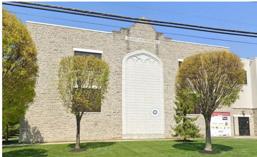
Figure 11: Portion of the 2004-built Saint Anastasia School.