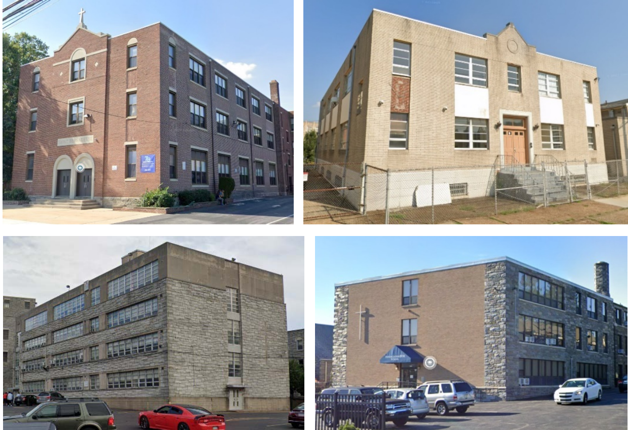
Figure 9: Left to Right, 1 st Row: Saint Bernadette School, 1001 Turner Road, Drexel Hill, PA, 1948. Immaculate Conception School, 811 N 8 th Street, Philadelphia, PA, 1951. 2 nd Row: Saint Martin School Annex, 5400 E Roosevelt Boulevard, Philadelphia, PA, 1956. Annunciation B.V.M. School Addition, 421 Brookline Boulevard, Havertown, PA, 1958.