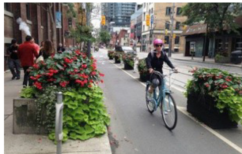
Bike lane separated with planters in Toronto