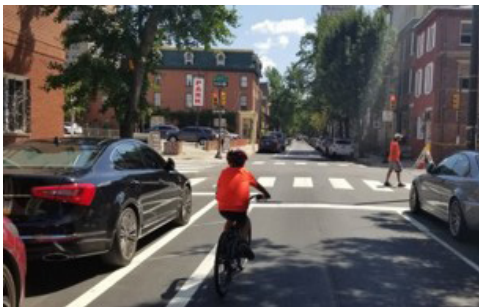
A child riding in the vehicle lane on Spruce Street with parked cars in the bike lane