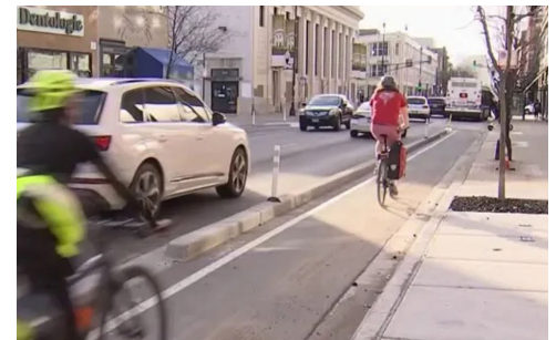
Bike lane separated with concrete curb sections in Chicago