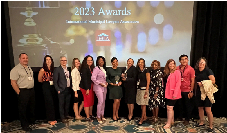
Conference presenters and awardees at the 88th Annual IMLA Conference in La Quinta, California

Every year, the Law Department submits nominations to receive awards at the International Municipal Lawyers Association Annual Conference, based on suggestions and input from staff. The awardees are selected by the IMLA Board of Directors.