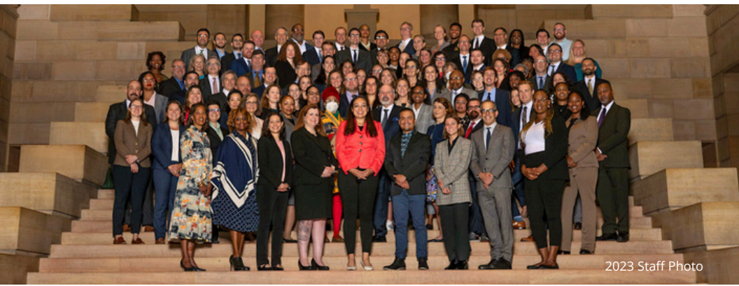
2023 Staff Photo