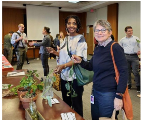
Plant Swap, March 2023