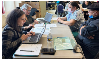
SeniorLAW Center Life Planning Clinic