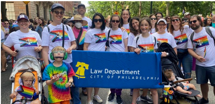
The Diversity, Equity, and Inclusion Committee represents the Law Department at the Philadelphia Pride March, June 2023

Public Service Committee The Public Service Committee (PSC) facilitates the creation of public service and volunteer opportunities for Law Department staff.