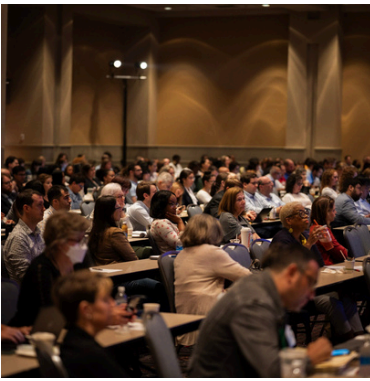
2023 CLE Conference