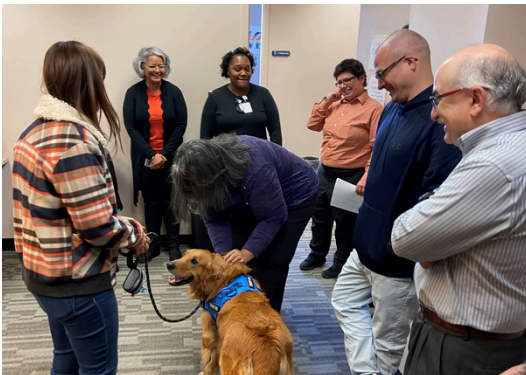
Therapy Dog Visit

The Law Department's dedication to legal excellence is inseparable from its commitment to diversity, equity, and inclusion (DEI). We celebrate the diversity of our staff, the City's workforce, and the residents whom we serve, and are committed to fostering an inclusive and equitable work environment.