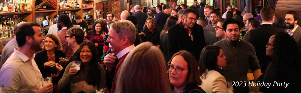
2023 Holiday Party

The Law Department is proudly Mansfield Plus certified , employing 30% historically underrepresented lawyers – including women lawyers, underrepresented racial and ethnic lawyers, LGBTQ+ lawyers, and lawyers with disabilities.