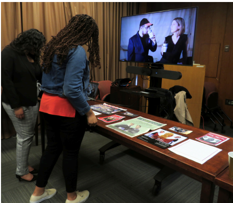
Arts and Crafts Fair, April 2023

The Law Department regularly hosts staff events to enhance a sense of community and inclusion across the department and promote staff wellbeing.