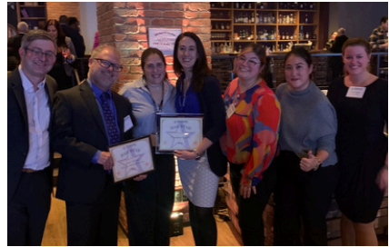
Philadelphia Bar Association Member Appreciation Reception