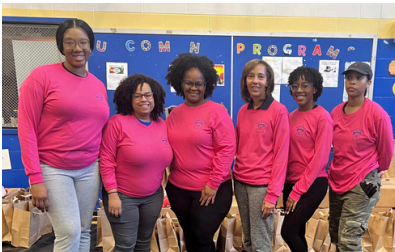
Barrister's Association Annual Amber Racine Turkey Drive