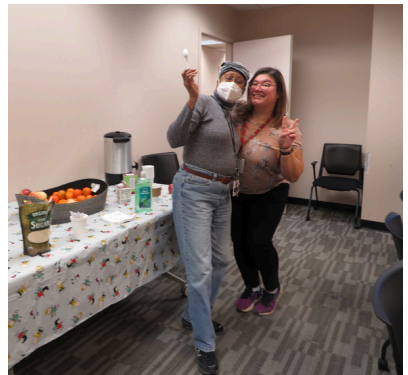
Administrative Professionals Day