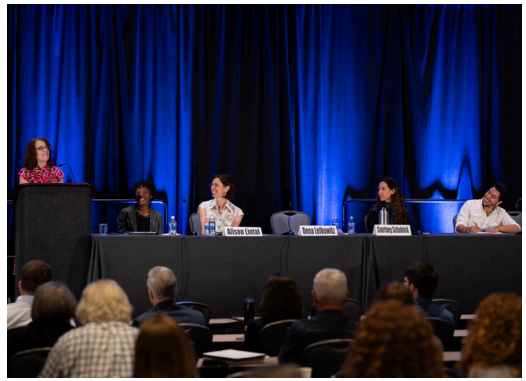
"Addressing Modern Racism" panel sponsored by the DEI Committee