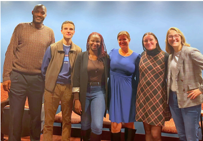
Undergraduate Mock Trial Competition

Staff are also provided with a Philadelphia Bar Association membership, through which they may access award-winning CLE programming and networking opportunities with other legal professionals.