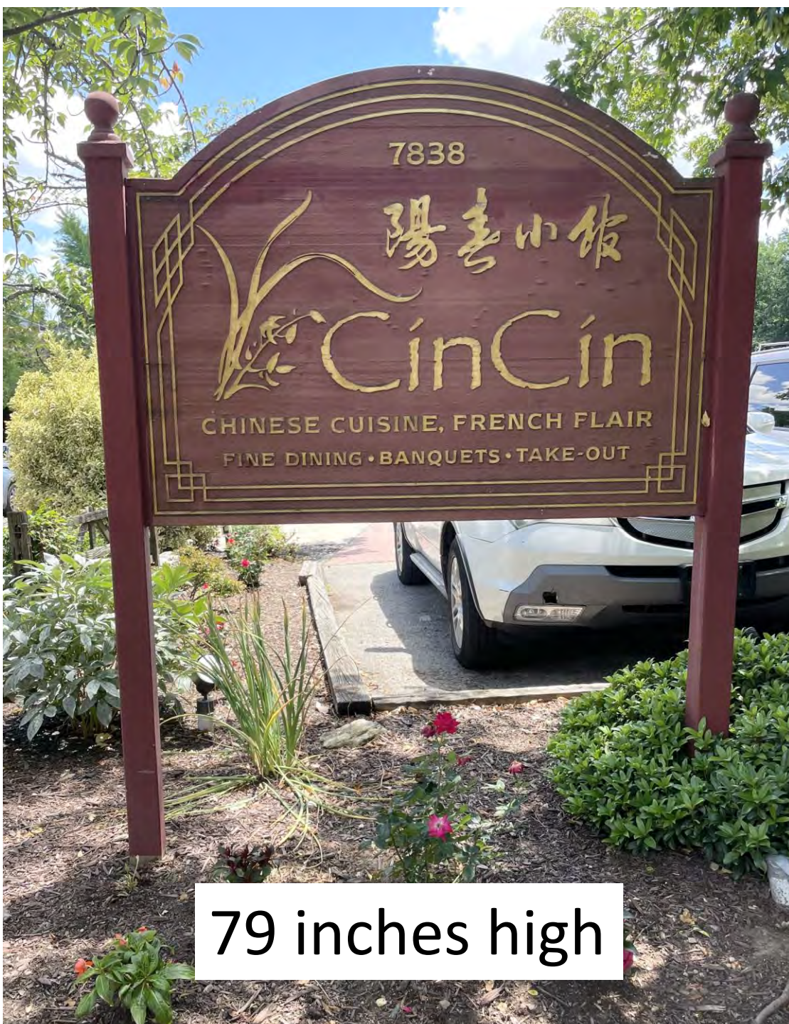
79 inches high