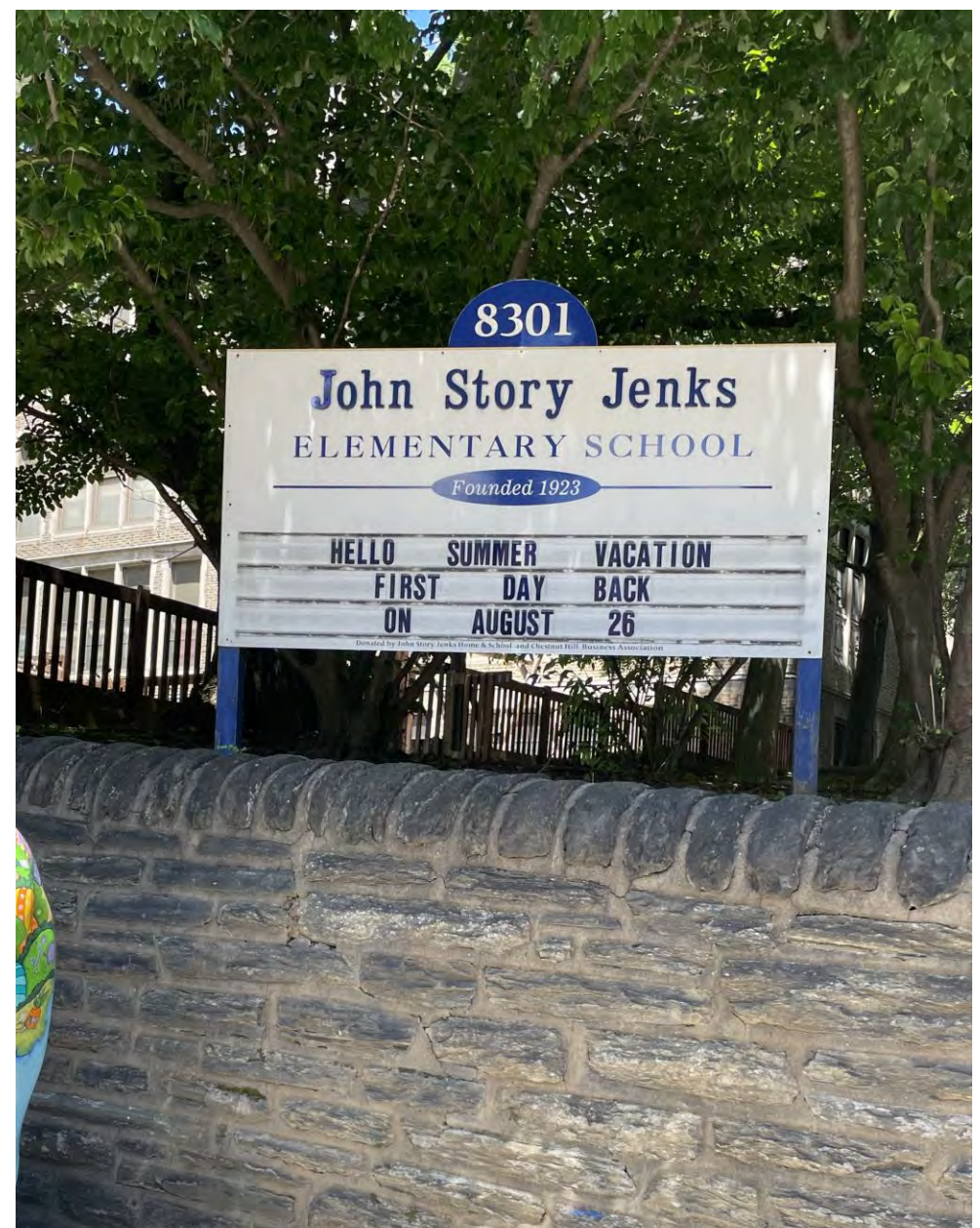
7 foot sign on 5 foot wall