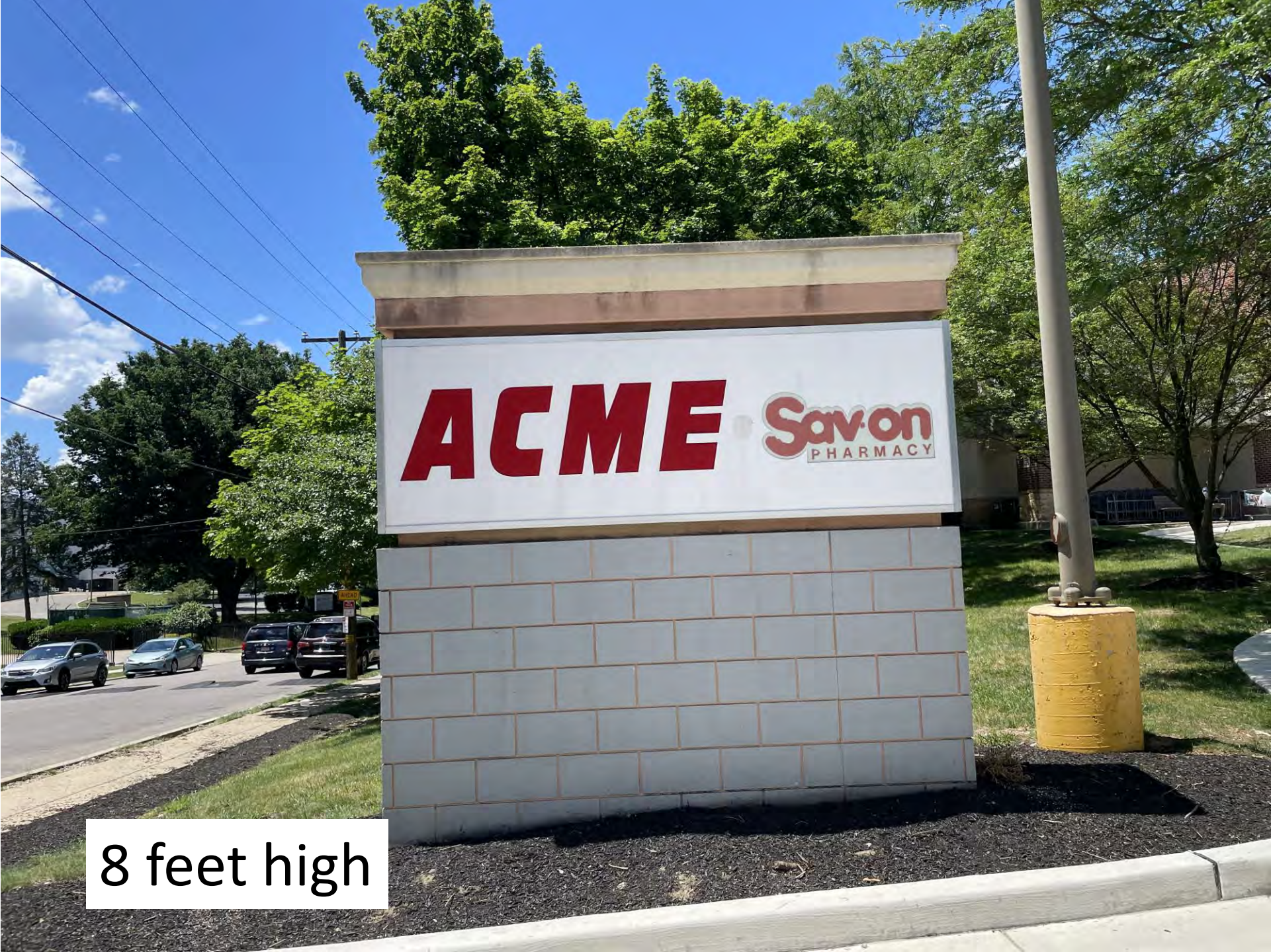
8 feet high