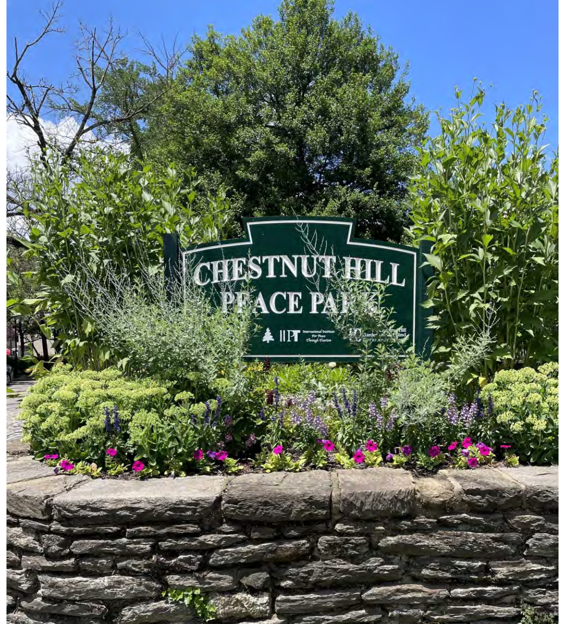
56 inch sign on 32 inch wall