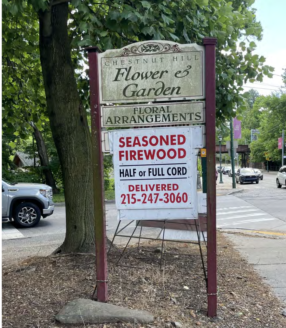
8 feet, 4 inches high