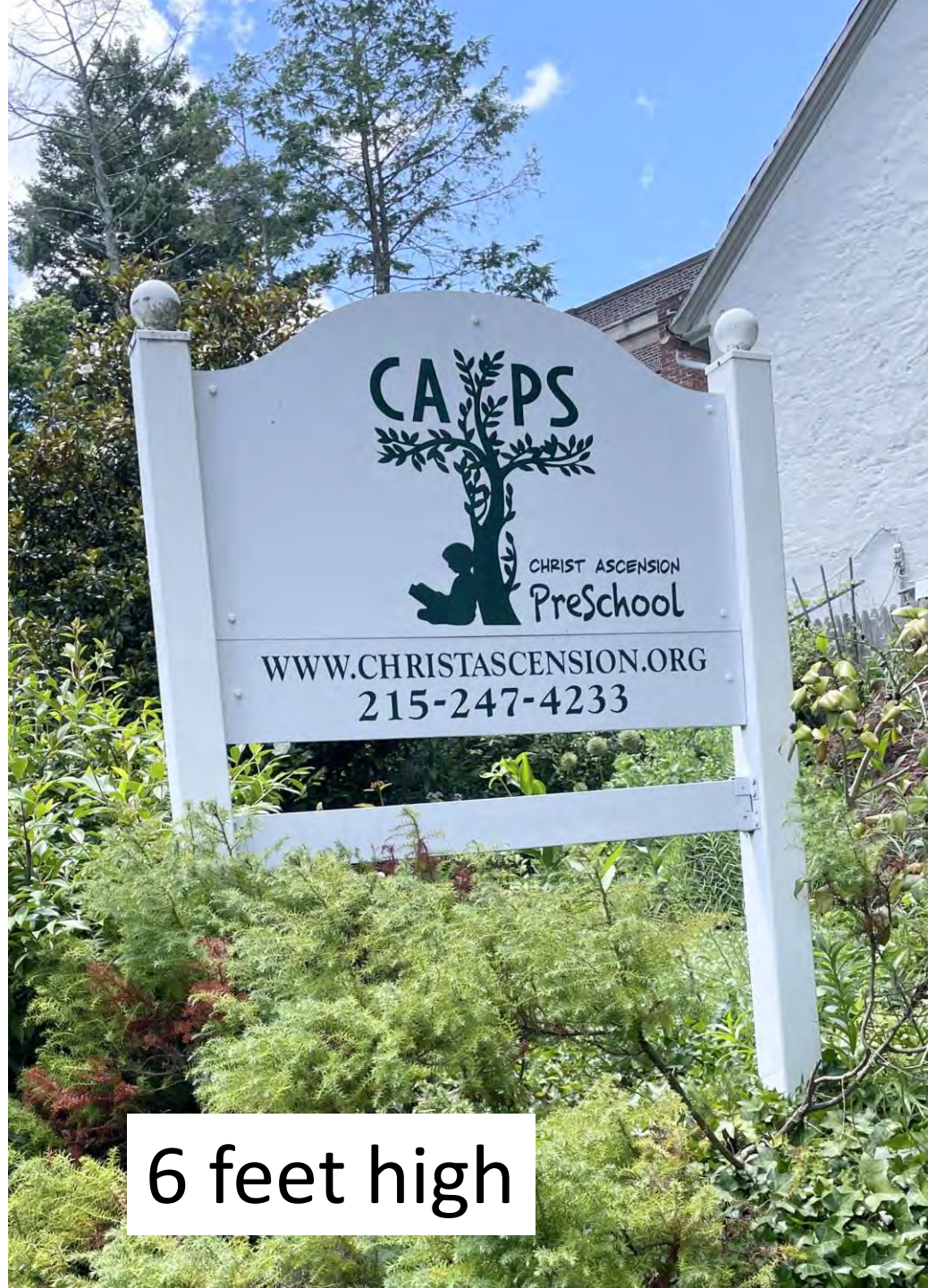
6 feet high