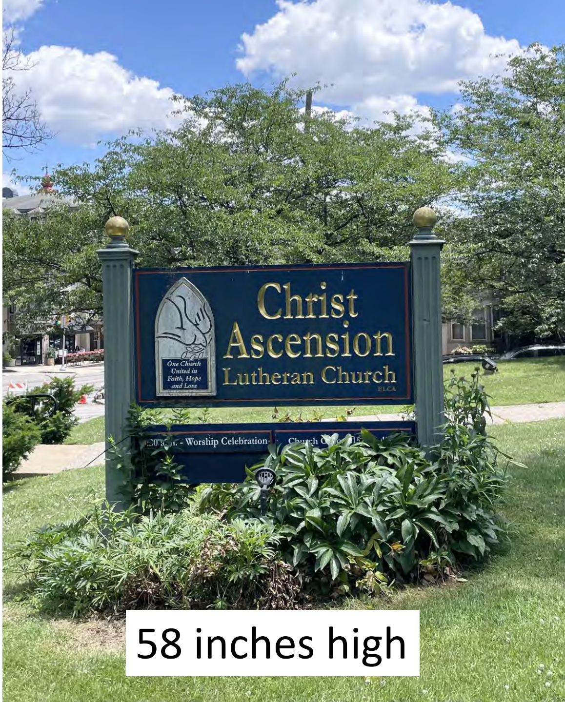
58 inches high