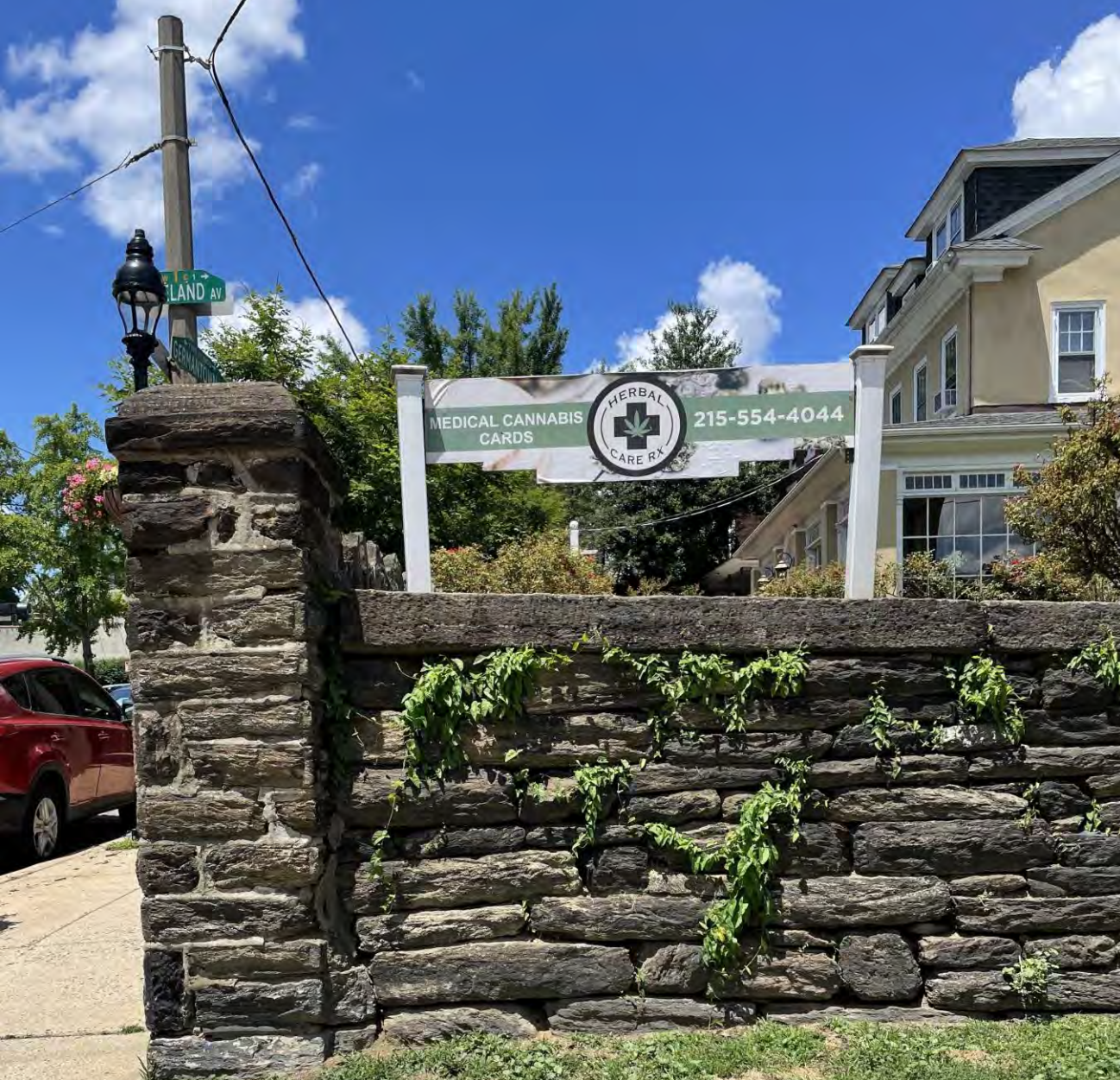
45 inch high sign on 56 inch wall