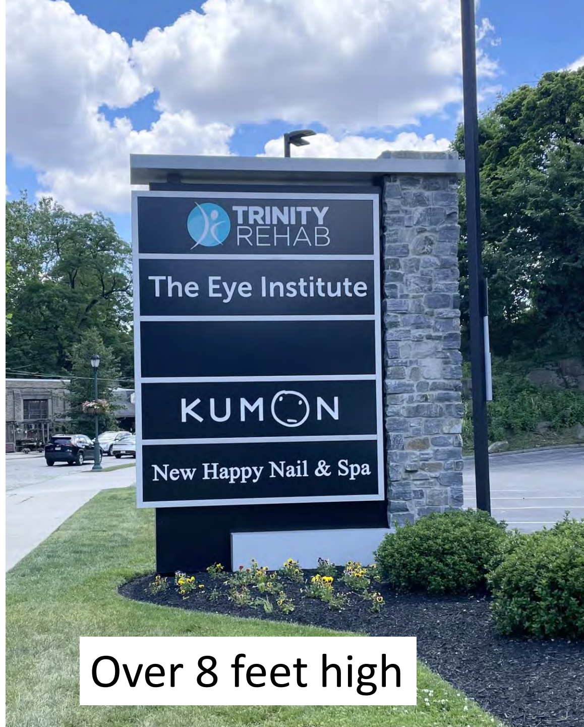
Over 8 feet high