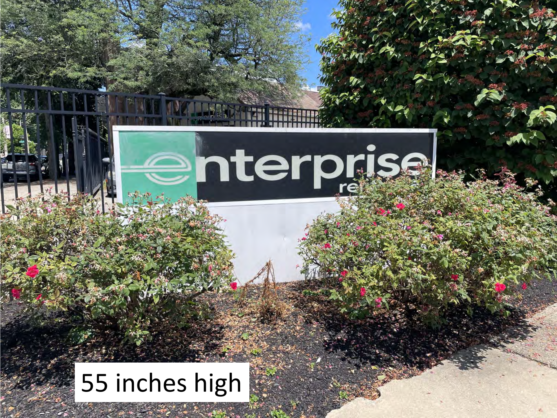
55 inches high