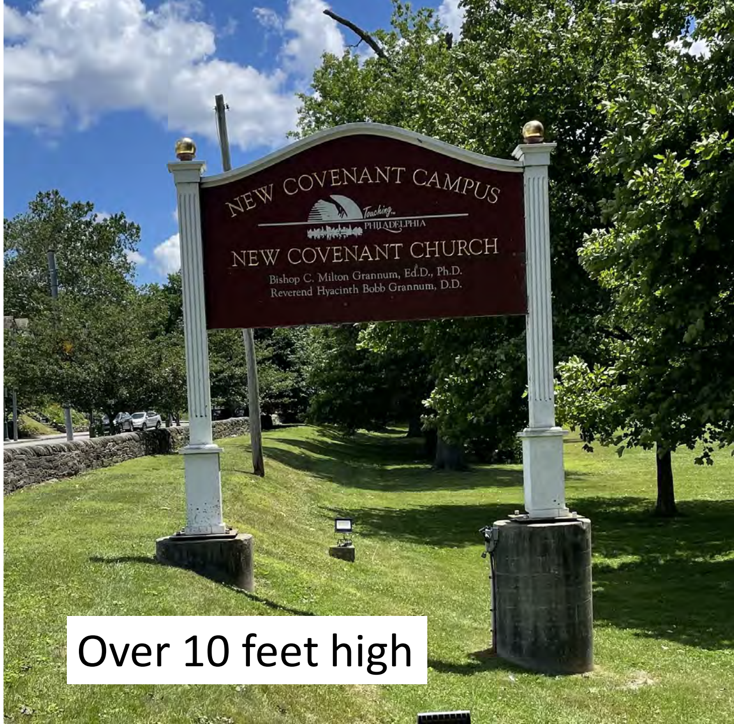
Over 10 feet high