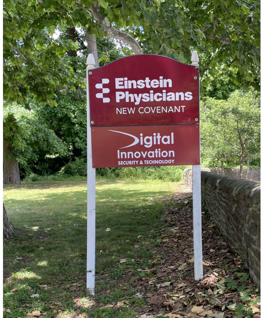
10 feet high