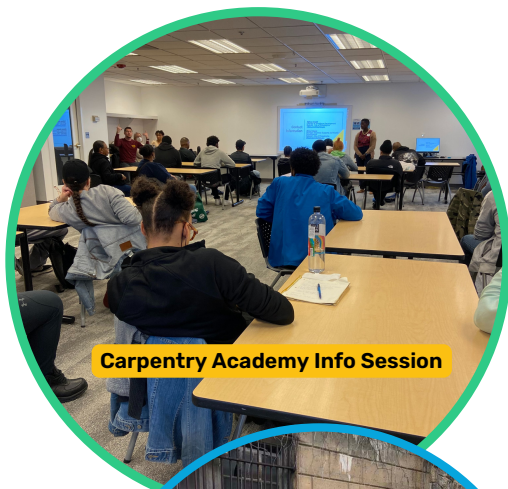
Carpentry Academy Info Session

Rebuild has completed 7 total workforce development skilled trades programs with the most recent program being the Masonry Academy (June 2022). Rebuild has graduated 70 participants across the 7 workforce development programs.