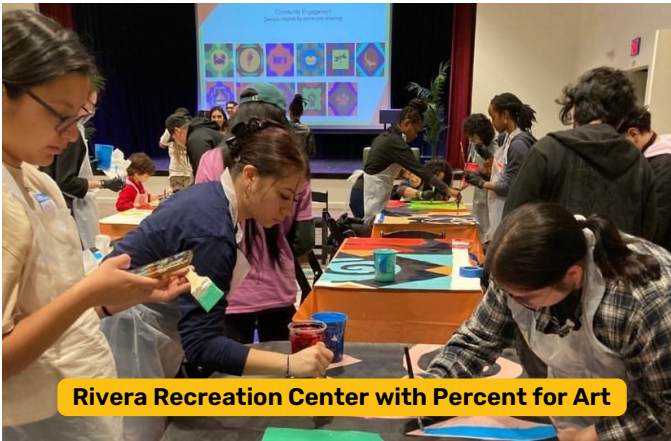
Riviera Recreation Center with Percent for Art

Rebuild and Project Users (non-profit partners) continued engagement activities with activities such as: