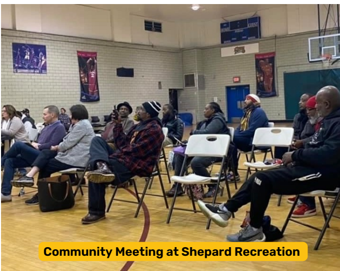
Community Meeting at Shepard Recreation