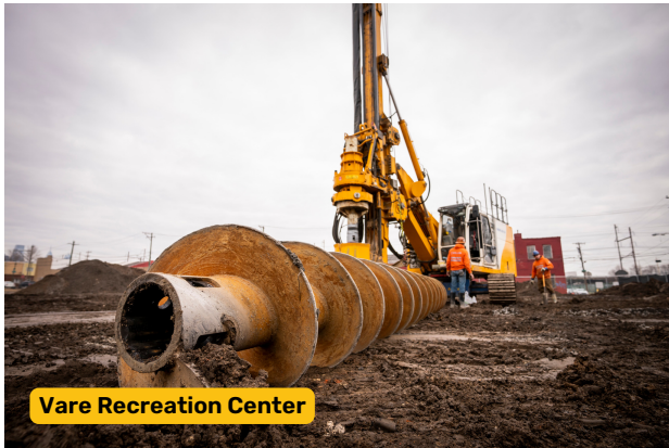
Vare Recreation Center