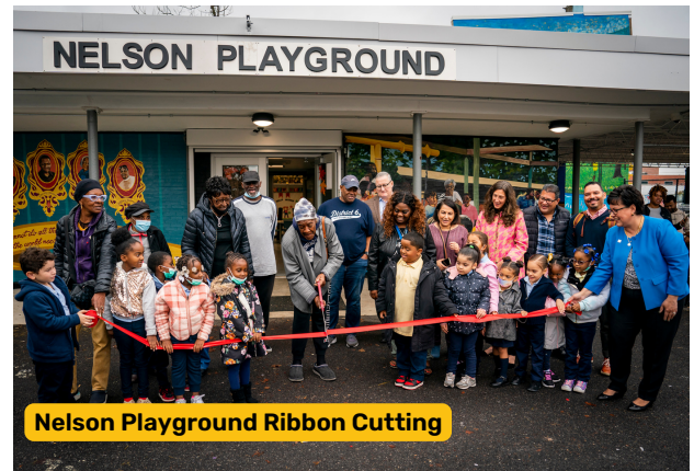
Nelson Playground Ribbon Cutting