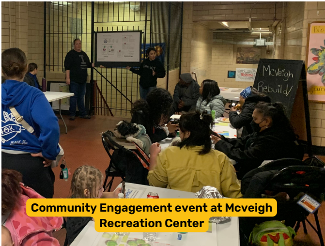
Community Engagement event at McVeigh Recreation Center

Rebuild continues to work with residents and staff to plan safe community engagement events for residents to engage with the Rebuild project in their neighborhood.