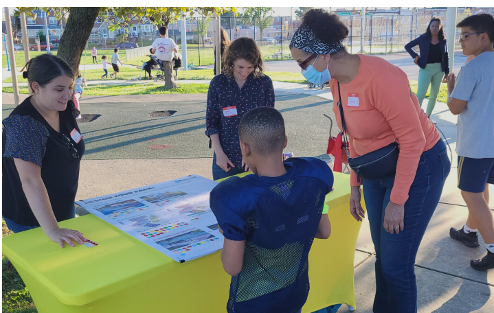
Community Engagement event at Pelbano Recreation Center