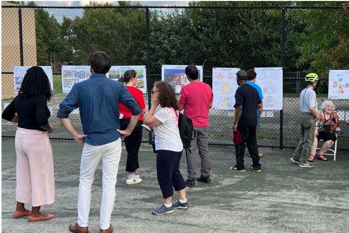
Community Engagement event at Kingsessing Library

Rebuild is actively engaging with communities at 23 different sites. The Rebuild process engages the community and empowers their voice during the design of improvements. While these community-led designs are underway, Rebuild also takes care of immediate needs with interim improvements. Rebuild dollars have created renewed playgrounds, sidewalks, windows, lighting, roof replacements, spray grounds, fields and more.