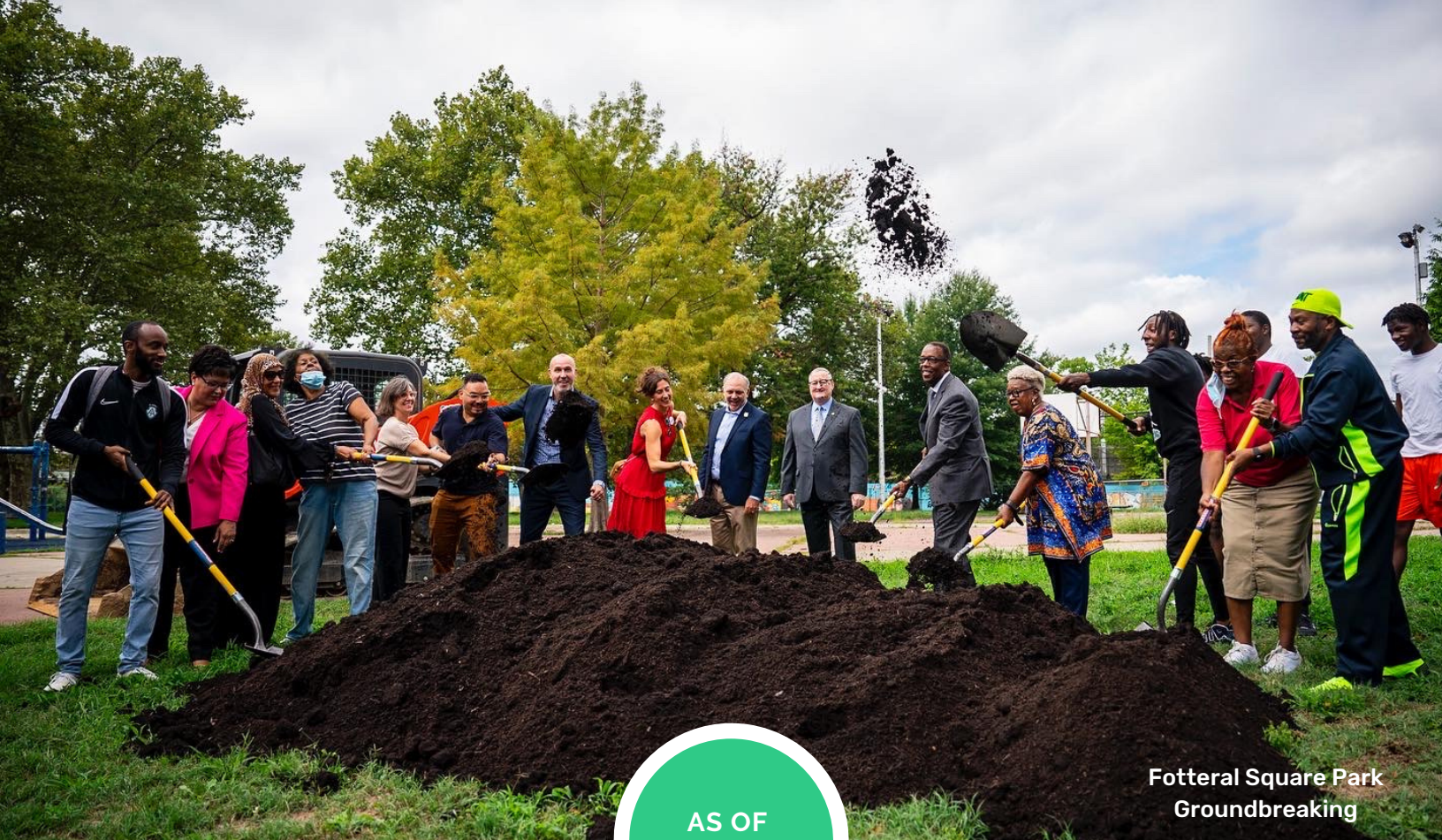
Fotteral Square Park Groundbreaking