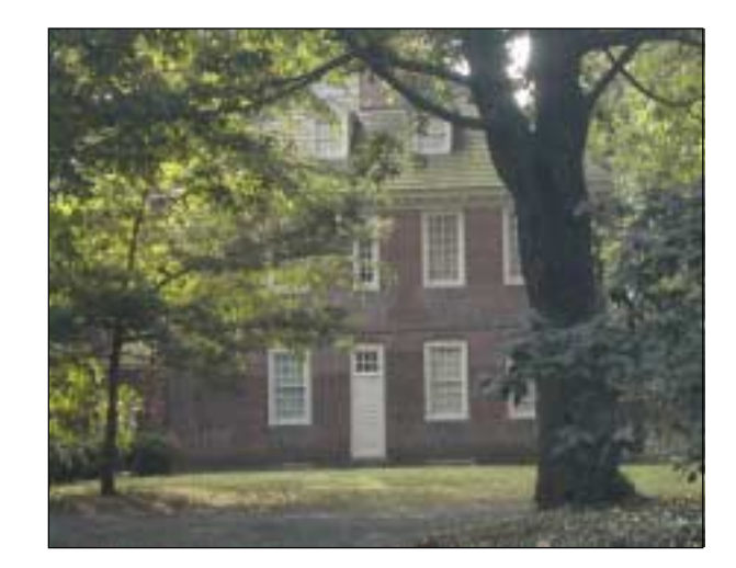
Two colonial buildings located in Stenton Park

The housing stock is characterized by small row homes on narrow streets. The housing is in generally good condition. However despite the neighborhood's history as a desirable middle-class community, Upper Nicetown in recent years has seen an increase in vacant homes, vacant lots, abandoned businesses and factories and a general decline in maintenance and upkeep of properties.