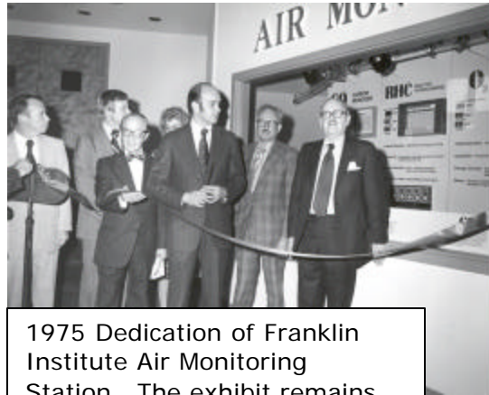
1975 Dedication of Franklin Institute Air Monitoring Station. The exhibit remains, and was updated in 2000.

1970 Air Management Services established a city-wide network of air monitoring stations, and began a comprehensive program to reduce particulates, sulfur dioxide, and hydrocarbon emissions. Detailed engineering surveys were made of companies throughout the city, compliance schedules were negotiated, air pollution inspectors patrolled the city looking for violations and responding to complaints and recalcitrant polluters were taken to court.